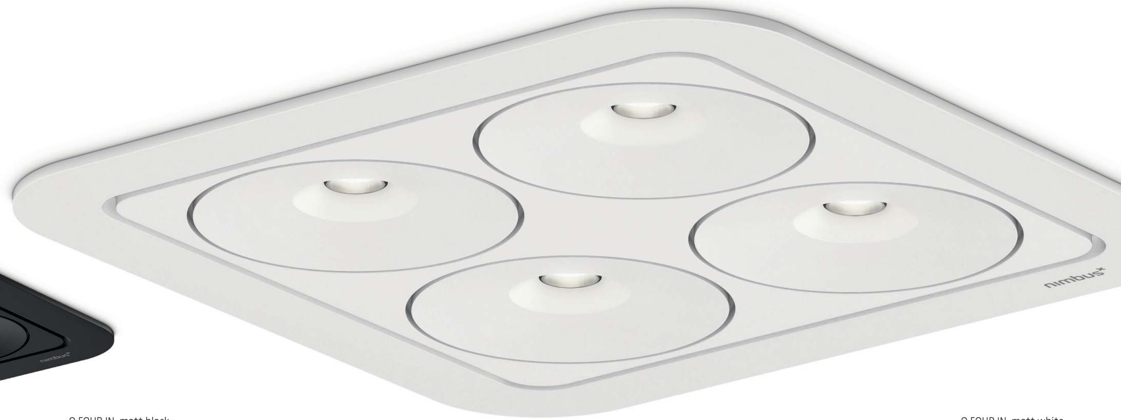
Q FOUR IN, matt white